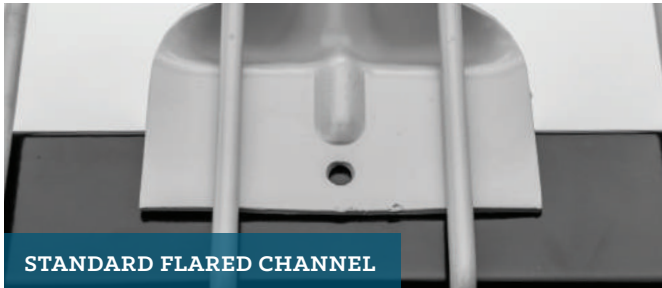
STANDARD FLARED CHANNEL