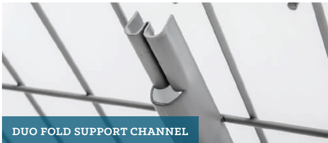
DUO FOLD SUPPORT CHANNEL